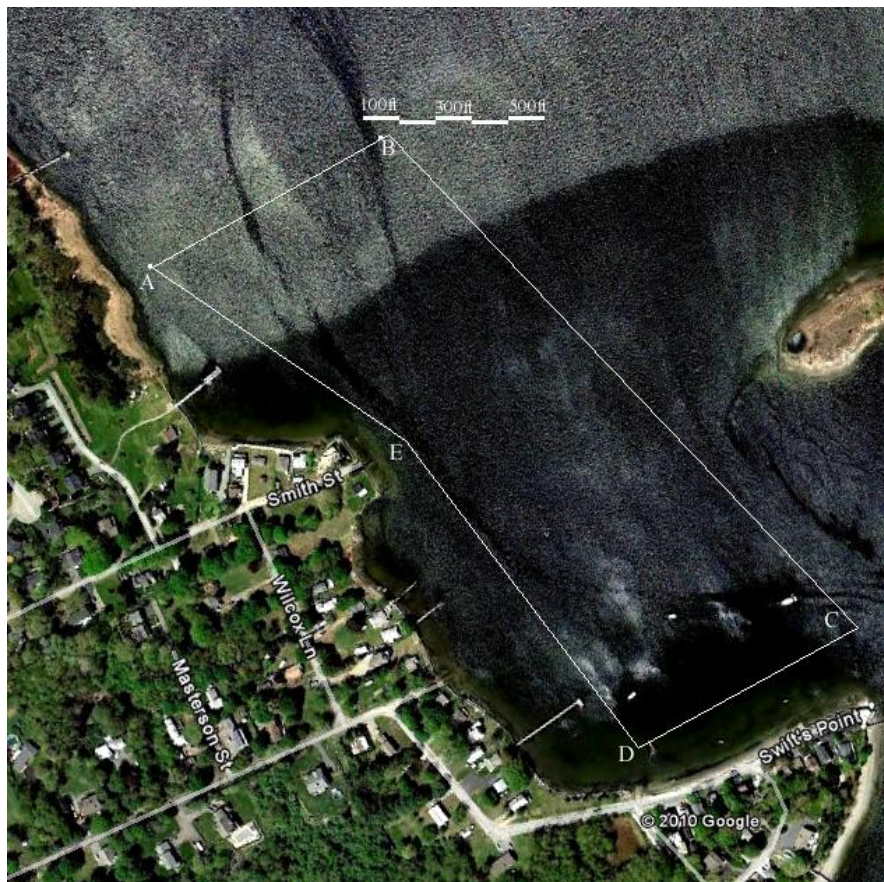
Smith Street / Kickemuit South

Total Moorings: 58 Water Depth: Average depth approx 6 ft. Priority Use: Recreational Boating Swimming Areas: private Moorings Field Status: Waiting list in place Vessels over 25 feet: Approx 29 boats No Commercial Moorings Permitted Moorings Boundaries: GPS Garmin V